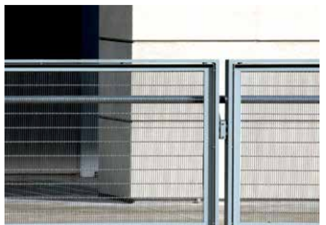
Title + image 4: The Art Institute of Chicago, Illinois, architect: Renzo Piano, France, mesh: PC-Tigris, ©GKD/Apple Group