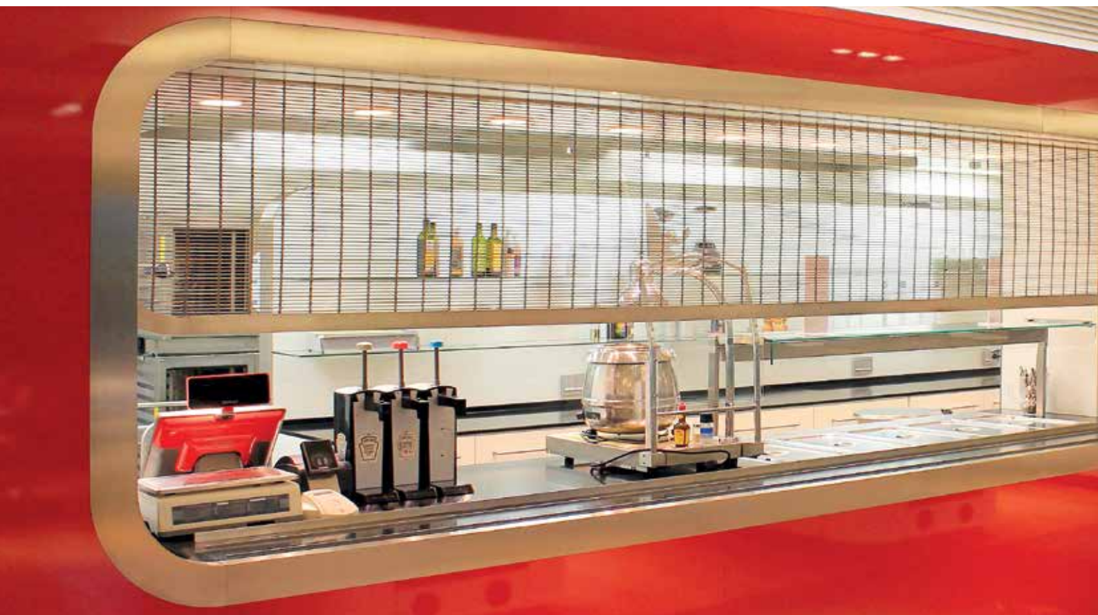
Roller shutter in a canteen, Münster, architect: Vervoorts & Schindler Architekten, Bochum, mesh: Tigris

all common building management systems. Depending on the model chosen, the systems are suitable for indoor or outdoor use. Thanks to their transparent appearance, our GKD metal meshes grant a view of the areas they cover and thereby help create an overall sense of space. A matched lighting concept allows these transparent aesthetics to be emphasised even more. The degree of transparency can be individually defined based on the density of the mesh used. As a system